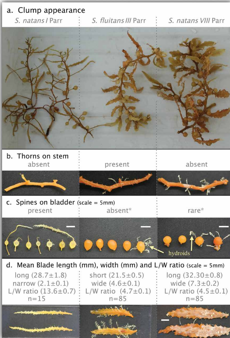
FIGURE 1. Characteristics of three pelagic Sargassum forms (left to right: S. natans I Parr, S. fluitans III Parr, and S. natans VIII Parr) collected during the 2014/2015 Caribbean inundation event. (a) Fronds showing arrangement of stem, blades, and bladders. (b) Section of stem highlighting presence/absence of thorns. Bladders and blades removed. (c) Bladders highlighting presence/absence of spines. Bladder stalk is directed downward in each photo. (d) Mean and standard error for length (mm), width (mm), and length/width ratio of blades. *Hyroid colonies are often present on Sargassum and can be mistaken for spines or thorns.