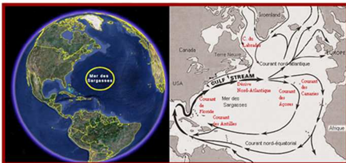
Fig. 2. http://wwz.ifremer.fr/guyane/content/download/41806/569470/file/Sargasses%20Guyane.pdf