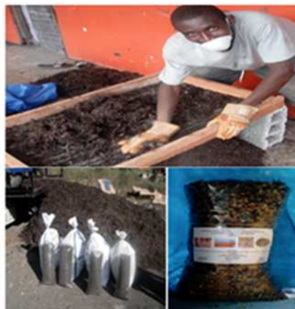
Fig. 4. Production of organic fertilizer from Sargassum (By Georges Valme, Leogane Haiti)

Algae extracts and algae have been shown to: